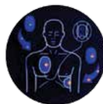
Visual cues prompt pad placement