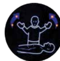
Stand clear of the patient